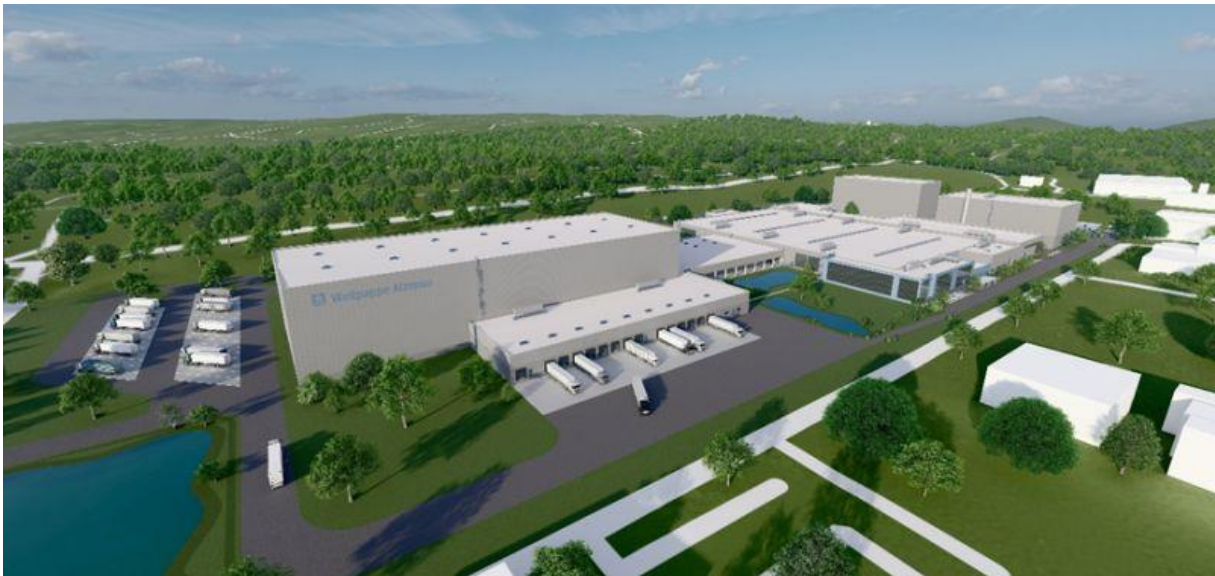
Illustration 1: Visualization of the new building in Alzenau

Wellpappe Alzenau is part of the Palm Group, based in Aalen, Baden-Württemberg, one of the leading manufacturers in the paper and packaging industry.